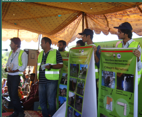
Demonstration of vernacular building methodologies at a Stakeholders' workshop.