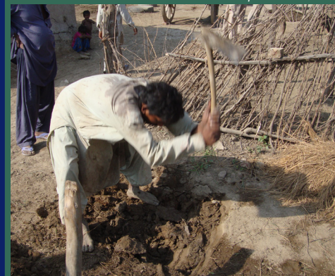
Participation of local community in the rehabilitation process.