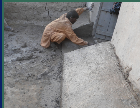
Construction of mud toe to provide protection to the base of the wall.