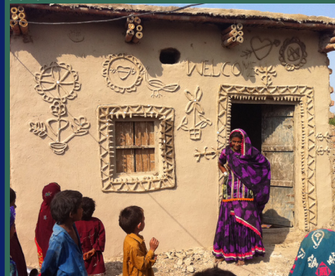
Proud owner of rehabilitated sustainable shelter, decorated it herself.