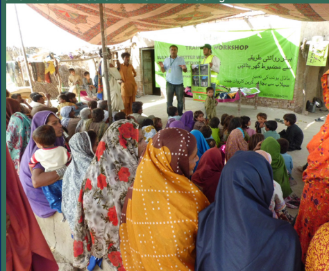
Stakeholders' workshop is being attended by a large number of women.