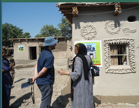
Project director accompanied by IOM visitor, reviewing completed unit with KaravanRoof and Lime-mud rendering.