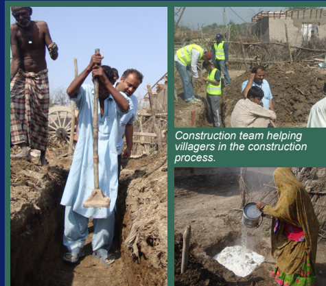
Tamping the soil in order to get a firm base.