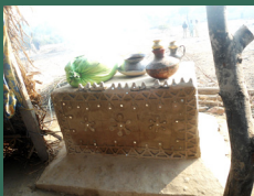
Raised platform for the safety of drinking water.