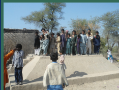
Earthen platform as cultural node, to provide safety of livestock feed.