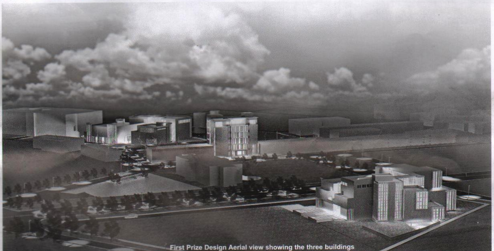
First Prize Design Aerial view showing the three buildings

According to the PCATP press release issued to ARCHI TIMES stated that the Pakistan Council of Architects and Town Planners was commissioned by National Textile University (NTU) to organize and conduct a single stage nationwide Architectural Design Competition open to all PCATP Registered Architects for the Multipurpose Hall, Administration, Academic & Research Block at National Textile University, Faisalabad.